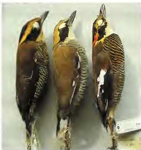
Plate 3. Banded Pitta females (lateral view): left to right, P. g. schwaneri, P. g. guajana and P. g. irena.